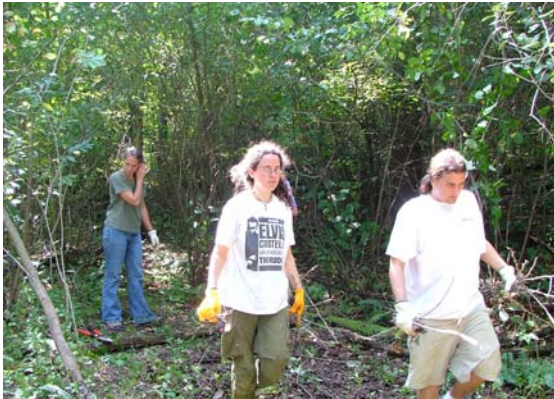
Rural Action Forestry volunteers help clear and prepare woodland habitat for understory planting

In September we worked on a project with the Rural Action Forestry Program to restore and reestablish some of the understory medicinal herbaceous plant communities. We planted bare roots of goldenseal, black cohosh and seeded ginseng. We also cleared brush and created a walking path through the area so that students and visitors can learn about this part of the forest community.