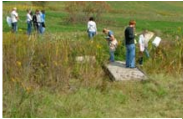
A high school zoology class nets insects and takes field notes at the habitat

We have already had several classes utilize the butterfly habitat for learning about insects, life cycles, ecology and restoration. Teachers and professors have a unique opportunity to bring their classes out to the habitat and teach students first hand about differences in habitats and the processes and species that are associated with them. Students are encouraged to bring their nets to catch and learn up close and personal about the insects that utilize the habitat.