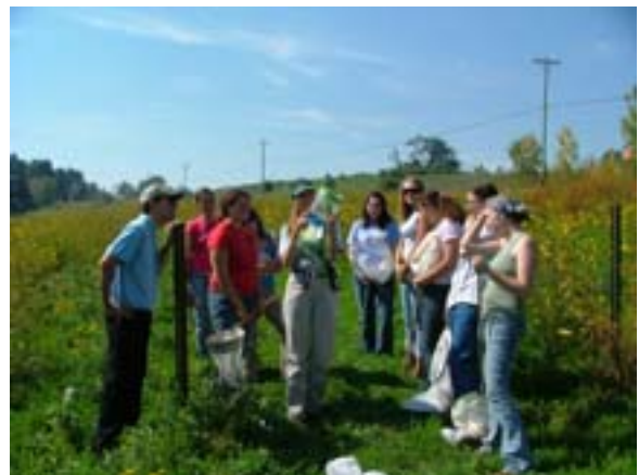
An ecology class from Denison University takes a closer look at a butterfly