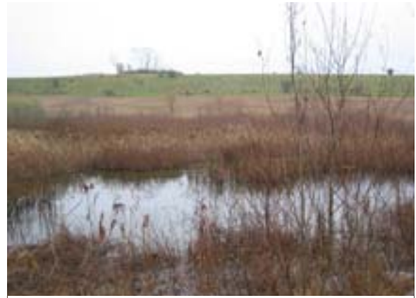
Wetland at Butterfly Habitat

Along the southern edge of the meadow habitat, there is approximately 3 acres of meandering wetland habitat. The existing vegetation includes cattails ( Typha angustifolia , T. latifolia ), willows ( Salix eriocephala , S. exigua , S. nigra ), rushes ( Juncus acuminatus , J. dudleyi , Eleocharis erythropoda , E. obtuse ), and sedges ( Carex annectens , C. frankii , C. granularis , C. lurida , C. molesta , Scirpus atrovirens , S. pendulus , S. validus ).