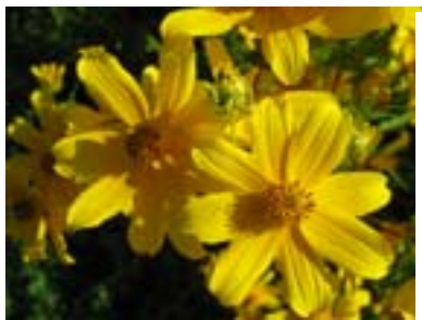
Close-up of tickseed sunflower at Butterfly Habitat

weeds were left un-mowed. Much of the 6-acre area that was planted in the fall of 2003 did not need mowing and several desirable plant species bloomed including the native annual, tickseed sunflower ( Bidens polylepis ), which gave a great late summer display.