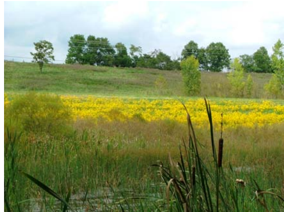
Wetlands adjoining the 6-acre meadow planted in Fall 2003