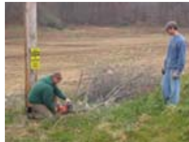
A veterinary volunteer group helps remove shrubs from the meadow habitat

We have been fortunate to have several volunteer groups contribute to the habitat through planting, seed collecting, weeding and trail work.