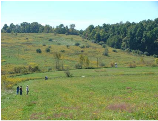
4-acre prairie planted in June 2004

weeds were left un-mowed. Much of the 6-acre area that was planted in the fall of 2003 did not need mowing and several desirable plant species bloomed including the native annual, tickseed sunflower ( Bidens polylepis ), which gave a great late summer display.