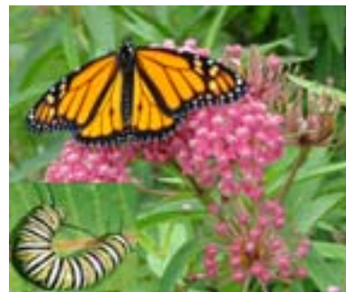
Monarch larva and adult butterfly on swamp milkweed

In late June, volunteers, interns, and staff planted additional plant species such as swamp milkweed ( Asclepias incarnata ), cardinal flower ( Lobelia cardinalis ), blue iris ( Iris versicolor ), Culver's root ( Veronicastrum virginicum ) marsh mallow ( Hibiscus mosheutos ), and button bush ( Cephalanthus occidentalis ). This summer, 15 monarch larvae were counted on swamp milkweeds that had been growing in the habitat for less than 1 year. We have subsequently increased our efforts to collect more swamp milkweed seeds and will be planting more next year. We will also continue to enhance the wetland habitat through further plantings and seedings.