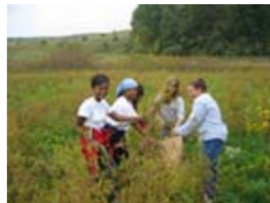
An Ohio State volunteer group helps collect seed from the butterfly habitat