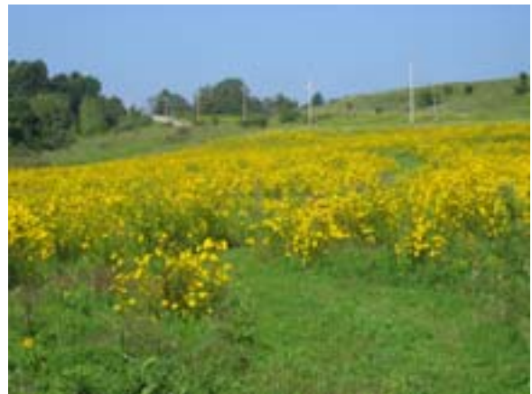
Meadow habitat in bloom during late summer