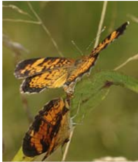
A mating pair of pearl crescent butterflies