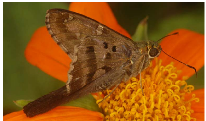
Long-tailed Skipper

In addition to conserving Taylor's Checkerspot, the Zoo has experienced phenomenal success in its work with another endangered butterfly, the Oregon Silverspot. Silverspots laid a record 8,000 eggs in the conservation lab last fall; the Zoo plans to release the butterflies this summer at Cascade Head near Lincoln City, Oregon. Their next conservation effort will be with another endangered northwest butterfly, the Mardon Skipper.