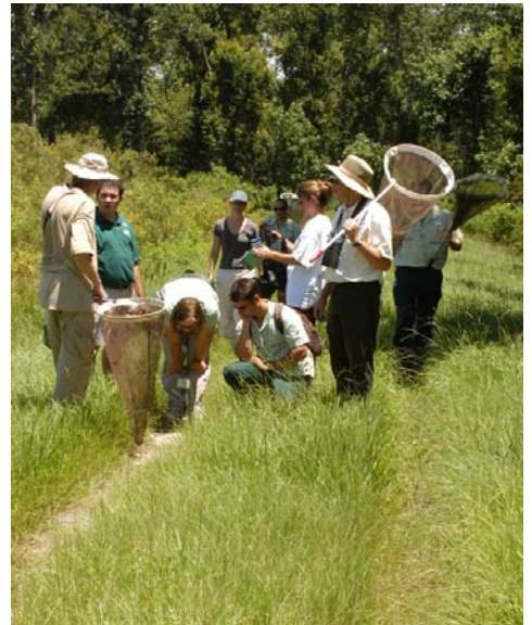
Disney's Animal Programs' staff members (part of the Florida Butterfly Monitoring Network) survey a Disney conservation area