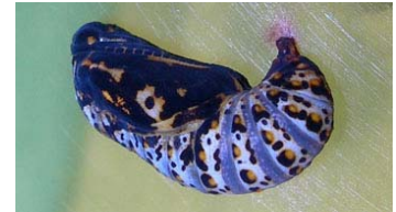
Taylor's Checkerspot Pupa

The Zoo retains some of the larvae they raise to observe Checkerspots throughout their life cycle. Zoo horticultural staff assists with the captive rearing by growing and maintaining the Checkerspot's host plants – Indian paintbrush ( Castilleja hispida ) and plantago ( Plantago lanceolata ).