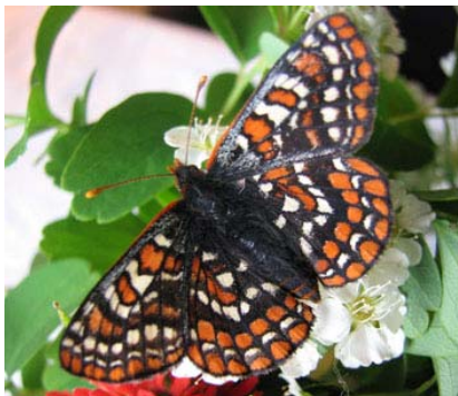
Adult Taylor's Checkerspot

For the first time, adult Taylor's Checkerspots from larvae raised in the Oregon Zoo's butterfly conservation lab have emerged in the wild. Taylor's Checkerspot is listed as a species of concern in the state of Washington and is currently under review for federal listing. This emergence marks a significant milestone in the effort to save this endangered Northwest butterfly.