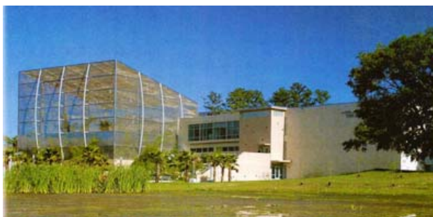
The McGuire Center for Lepidoptera and Biodiversity

The office of BFCI completed its move to the McGuire Center for Lepidoptera and Biodiversity at the Florida Museum of Natural History, University of Florida in May. I would like to take this opportunity to introduce you to BFCI's long-standing partner and proud, new host institution.