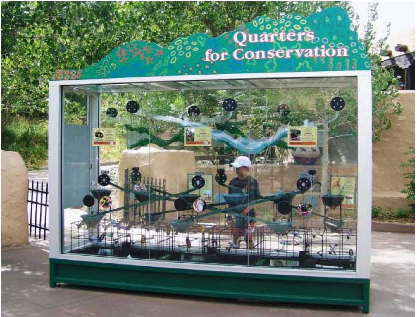
Cheyenne Mountain Zoo's Quarters for Conservation voting station

The Cheyenne Mountain Zoo in Colorado Springs has instituted a program to fund multiple wildlife conservation projects at the Zoo and in the field. The Quarters for Conservation program allocates a portion of the fees paid for Zoo admission, memberships, and classes to wildlife conservation. Every time a guest visits the Zoo, they help to expand conservation efforts in the region and around the globe.