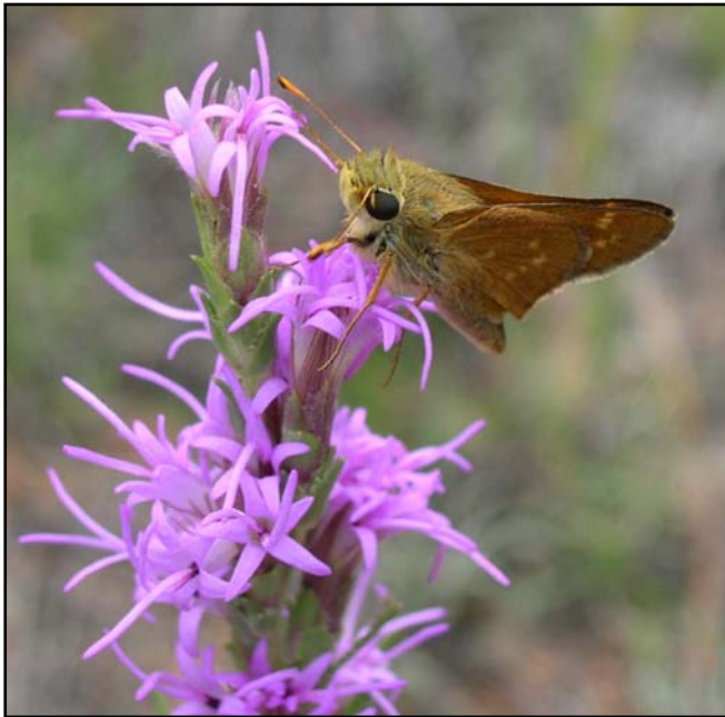
Pawnee montane skipper, a federally listed threatened butterfly