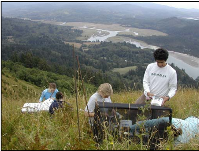
Lewis and Clark College students and Nature Conservancy staff place tubs of larvae into eclosion cages.

This medium-sized, brown-and-orange butterfly once ranged from Washington to Northern California where it occurred in coastal salt spray meadows, stabilized dunes, and montane meadows. There it had available stands of early blue violet Viola adunca , the essential food plant of silverspot larvae. The silverspot is now believed to be extirpated from Washington and appears in only four known sites in Oregon.