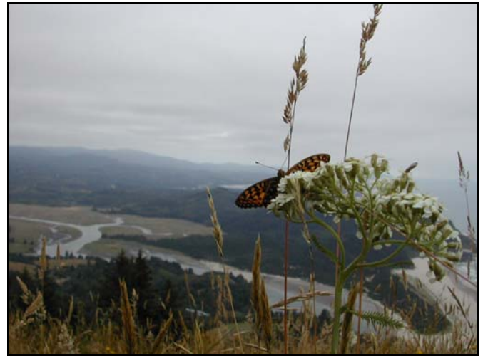
Newly eclosed male at Cascade Head, Nature Conservancy land on the Oregon coast

rearing and release program in partnership with the Oregon Zoo and Lewis and Clark College at the Nature Conservancy's Cascade Head Preserve in Oregon.