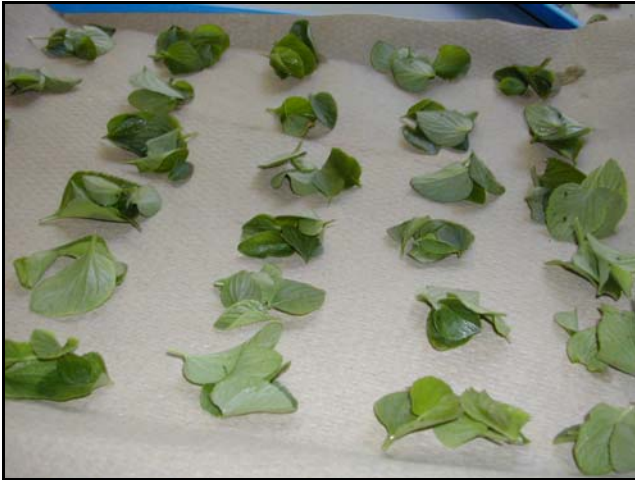
Freshly prepared early violet leaves ready for consumption

After winter dormancy, the larvae are fed leaves of the early blue violet. Zoo entomologists have determined that each larva eats approximately 200 medium-sized violet leaves before pupating.