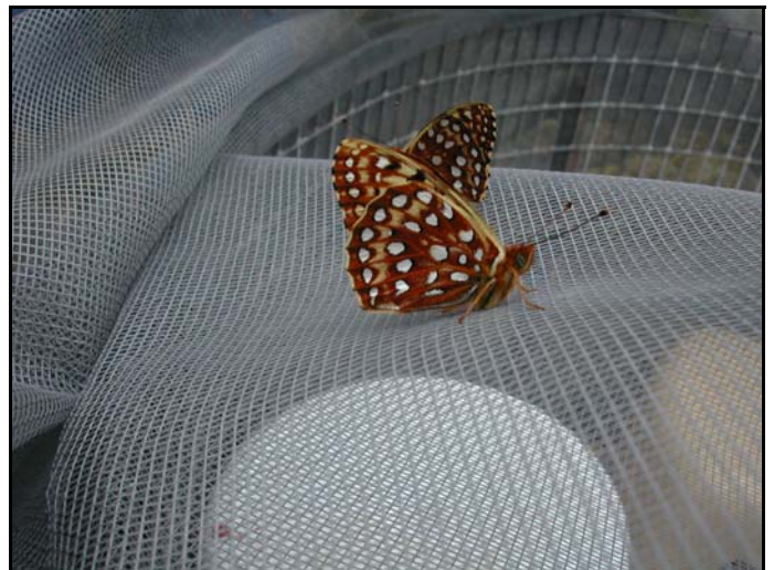
Newly eclosed adult Oregon silverspots

For more information on the Woodland Park Zoo's Oregon Silverspot Butterfly Project visit: http://www.zoo.org/conservation/silverspot.html