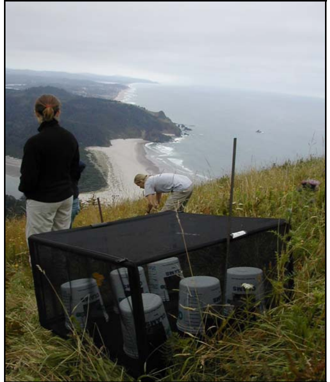
Lewis and Clark College students and Nature Conservancy staff prepare eclosion cages.

This season, over 600 silverspot larvae were raised and placed into diapause over the course of a few weeks in October and November, 2007. The larvae will be removed from diapause in May and will be returned to the wild to complete their development.