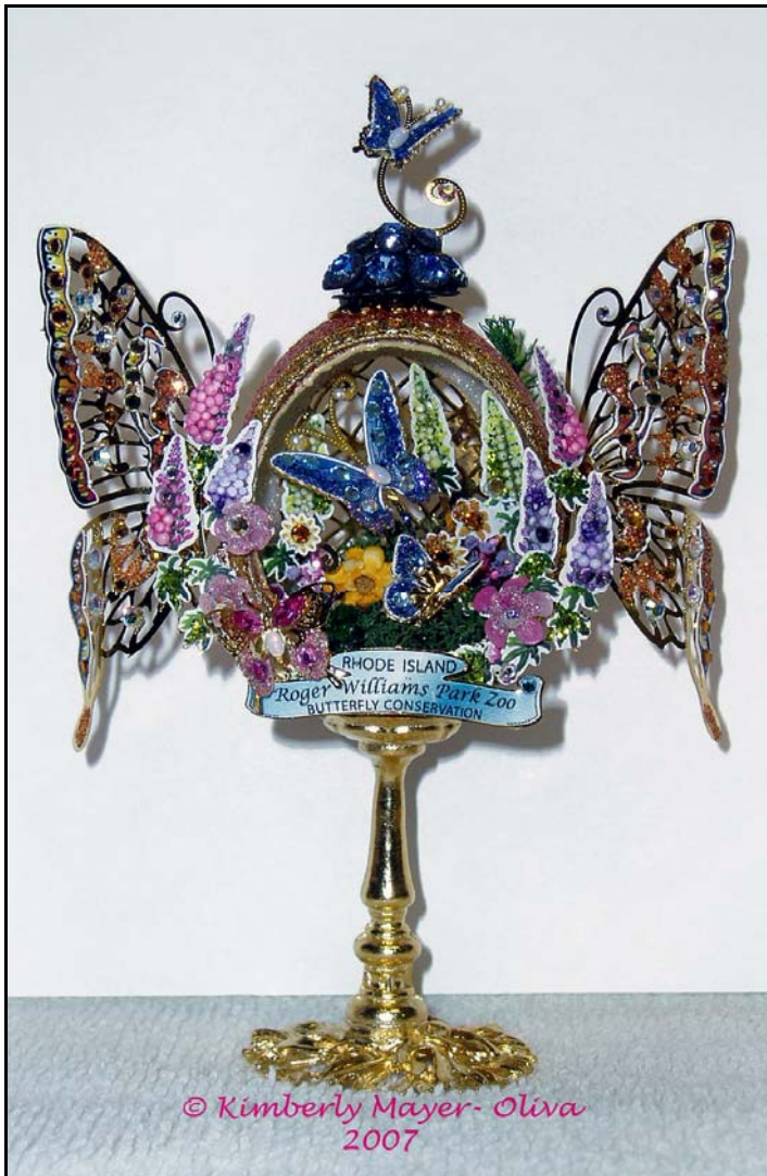
Rhode Island's White House egg representing Roger Williams Park Zoo's Karner blue conservation efforts

An egg celebrating BFCI member Roger Williams Park Zoo's Karner Blue conservation efforts will represent Rhode Island at the White House this upcoming Easter for the annual display of decorated eggs from each state.